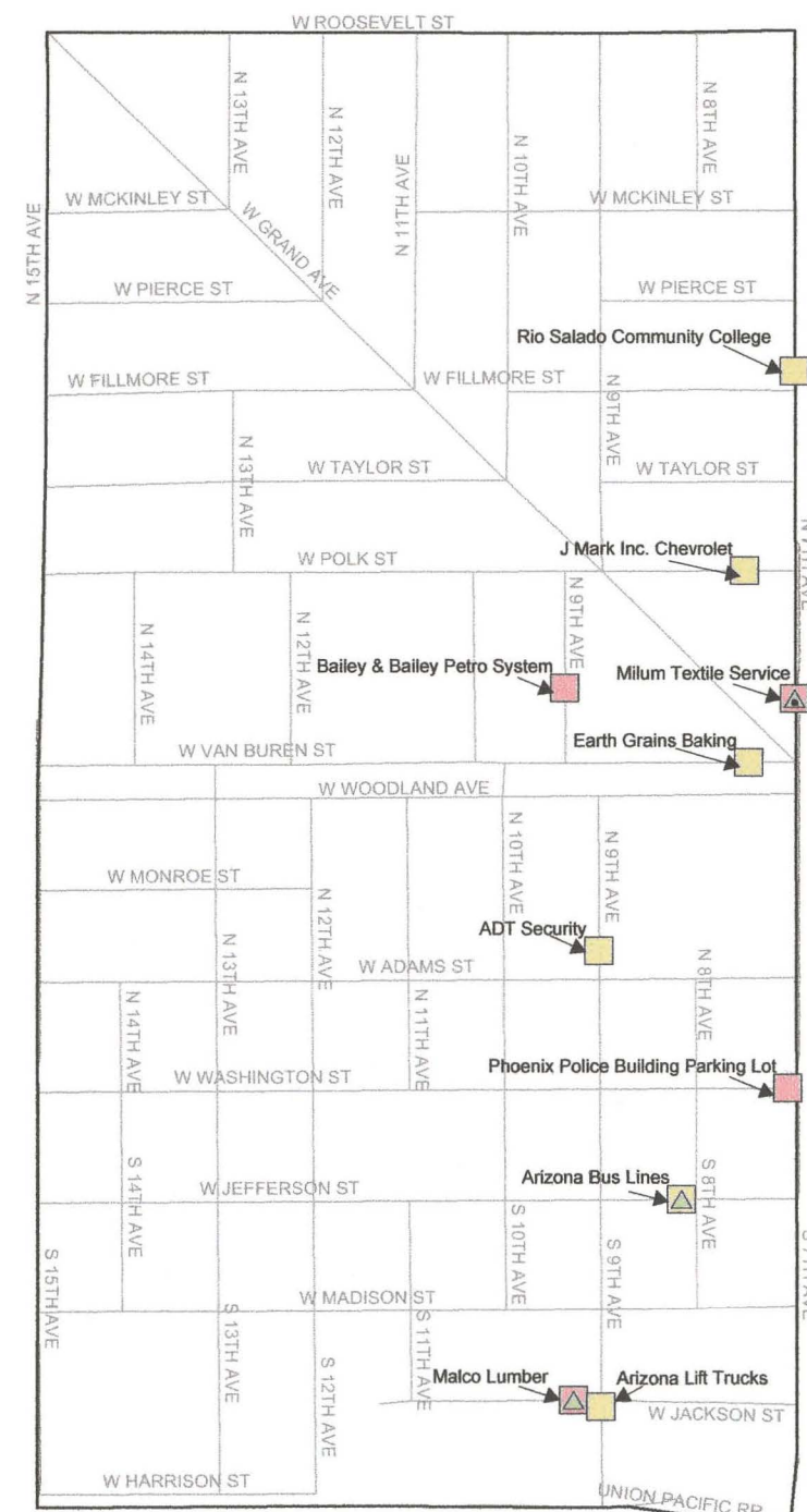
Figure 3.1 File Review Facility Locations

* To be used in conjunction with Figure 2.1 - Facility Locations or Appendix A - City Directory Review Results by Address ** There is no 1000-1100 block on W Fillmore St (point not plotted)