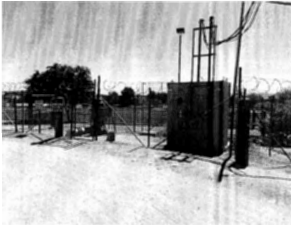
Well RID-86 and RID Canal, near S. 63 rd Avenue and W. Durango Street, looking south photographed by Ronnie Hawks 9-26-14 Western Valley Elementary School in background

Just as there are no groundwater-related health risks to children playing near Well RID-86, there are no risks to children playing anywhere or to the public at large from RID's irrigation groundwater pumping. The persistent references to health risks and unfounded claims of substantial endangerment that appear throughout the RID Draft FS Report seem to be designed to make the case for immediate treatment of groundwater to further RID's ultimate goal of obtaining treated groundwater to sell to West Valley potable water providers.