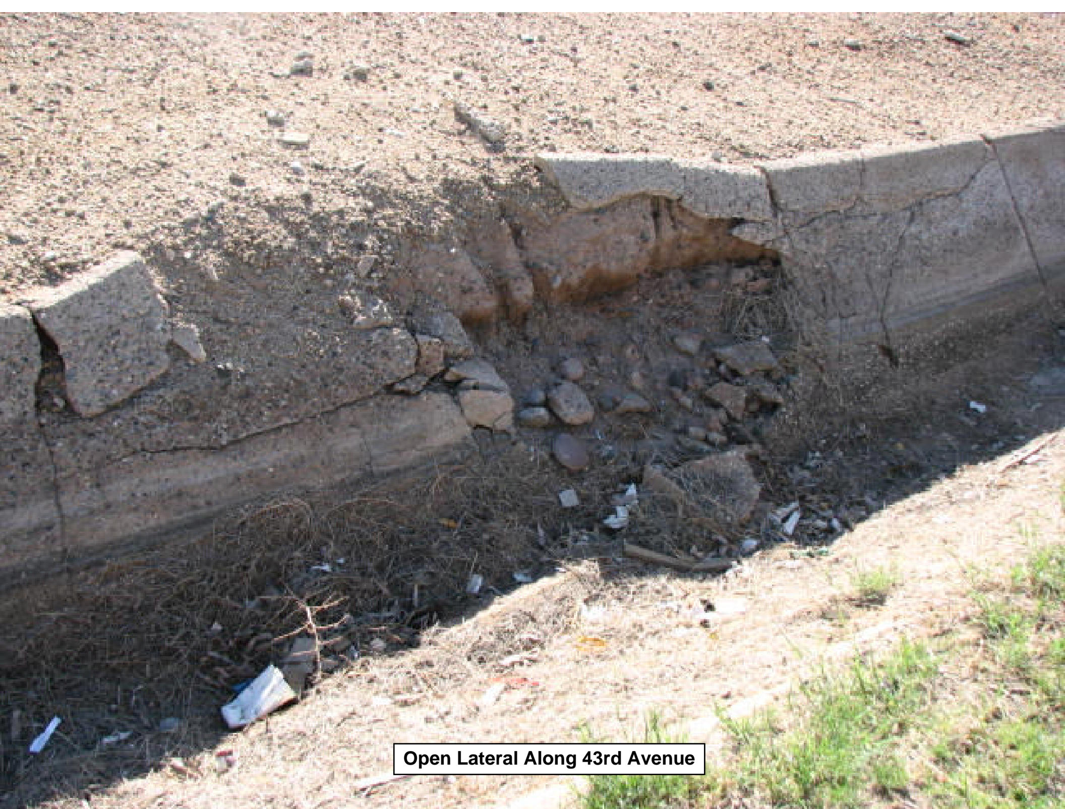
Open Lateral Along 43rd Avenue