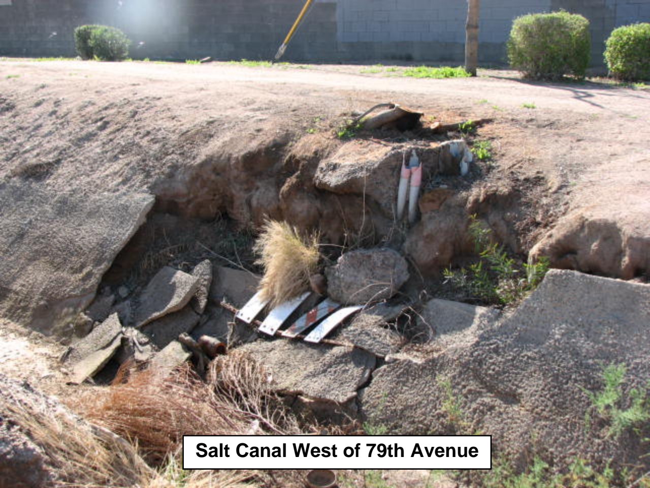
Salt Canal West of 79th Avenue