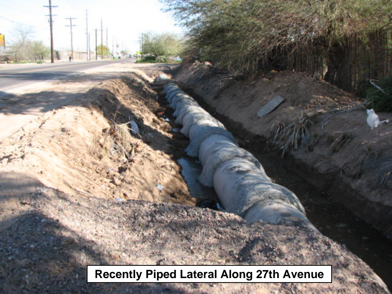
Recently Piped Lateral Along 27th Avenue