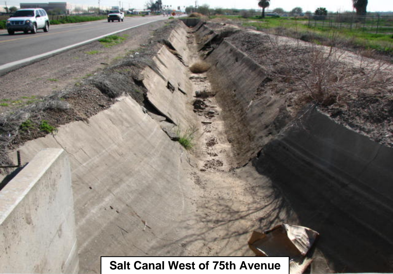
Salt Canal West of 75th Avenue