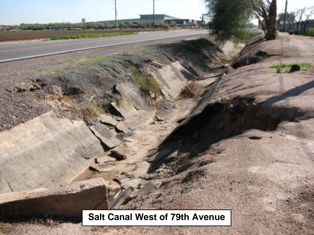
Salt Canal West of 79th Avenue