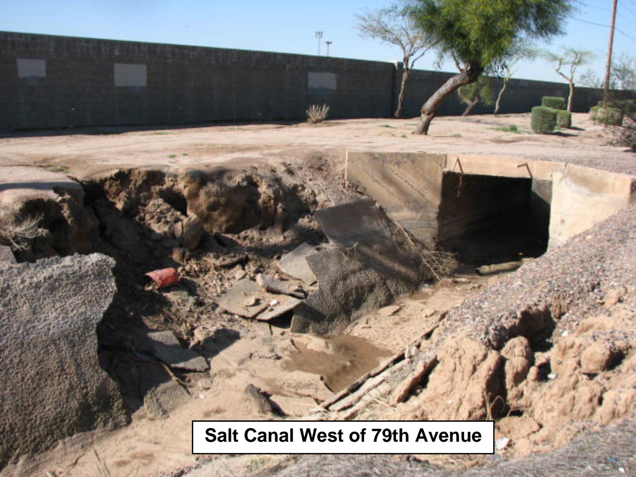
Salt Canal West of 79th Avenue