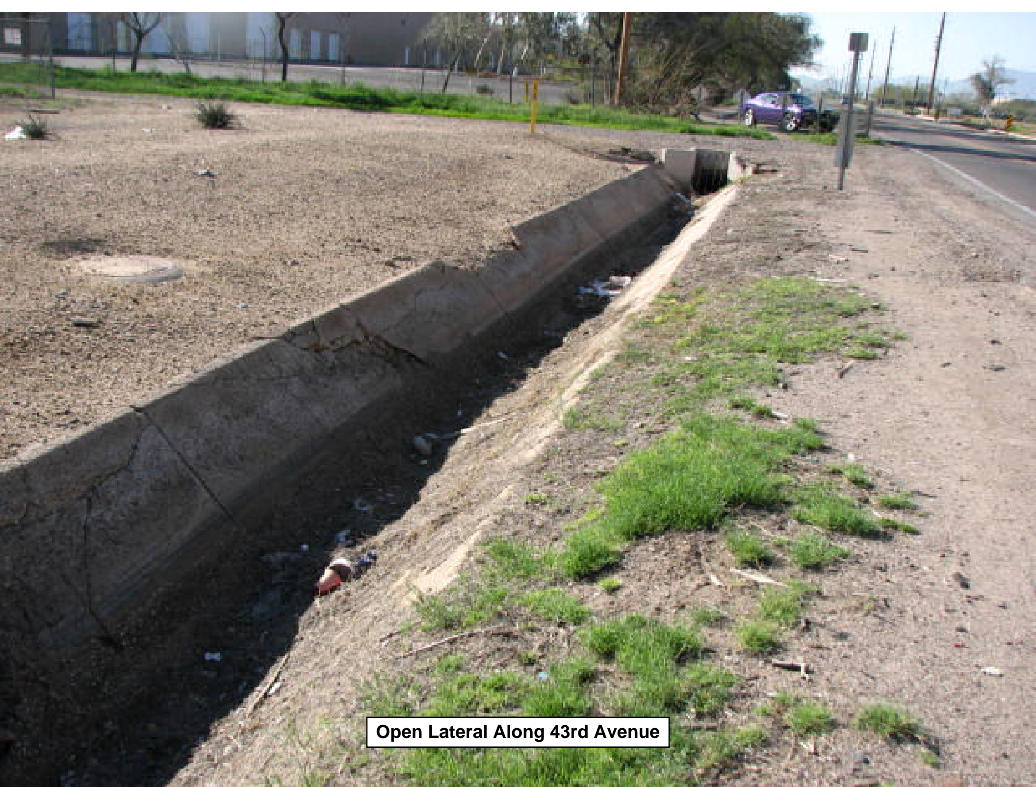
Open Lateral Along 43rd Avenue