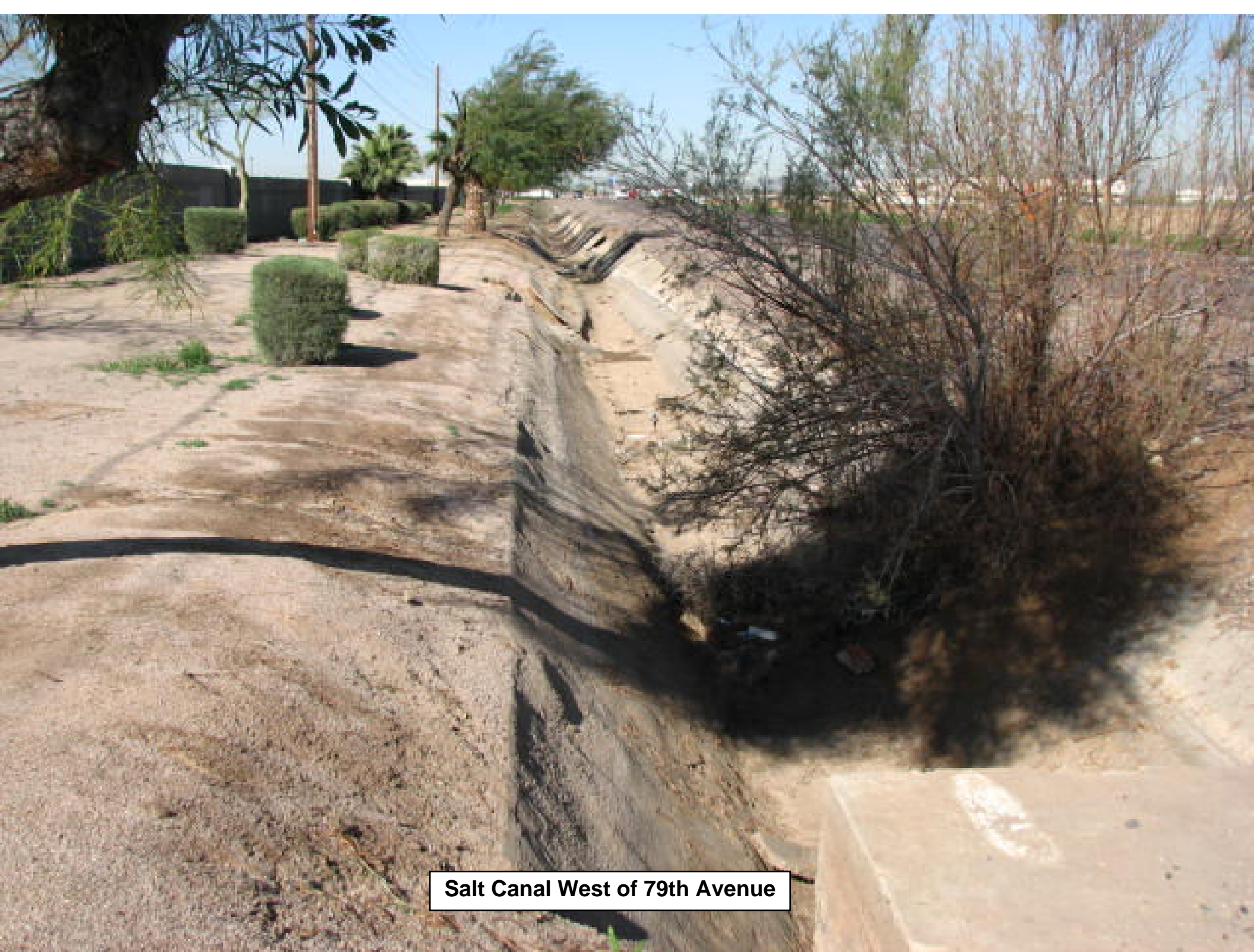
Salt Canal West of 79th Avenue