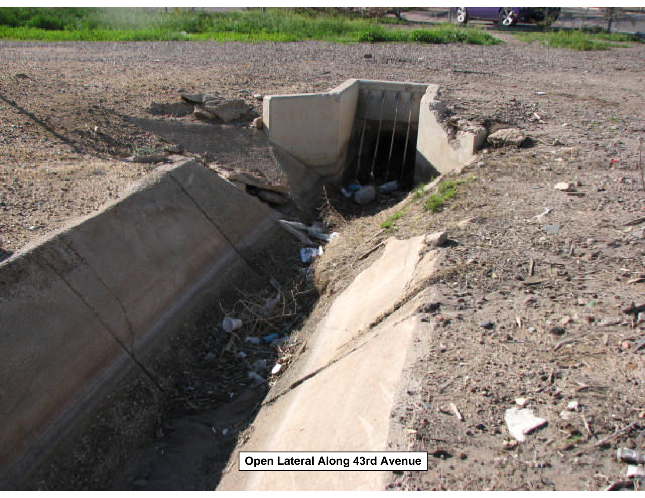
Open Lateral Along 43rd Avenue