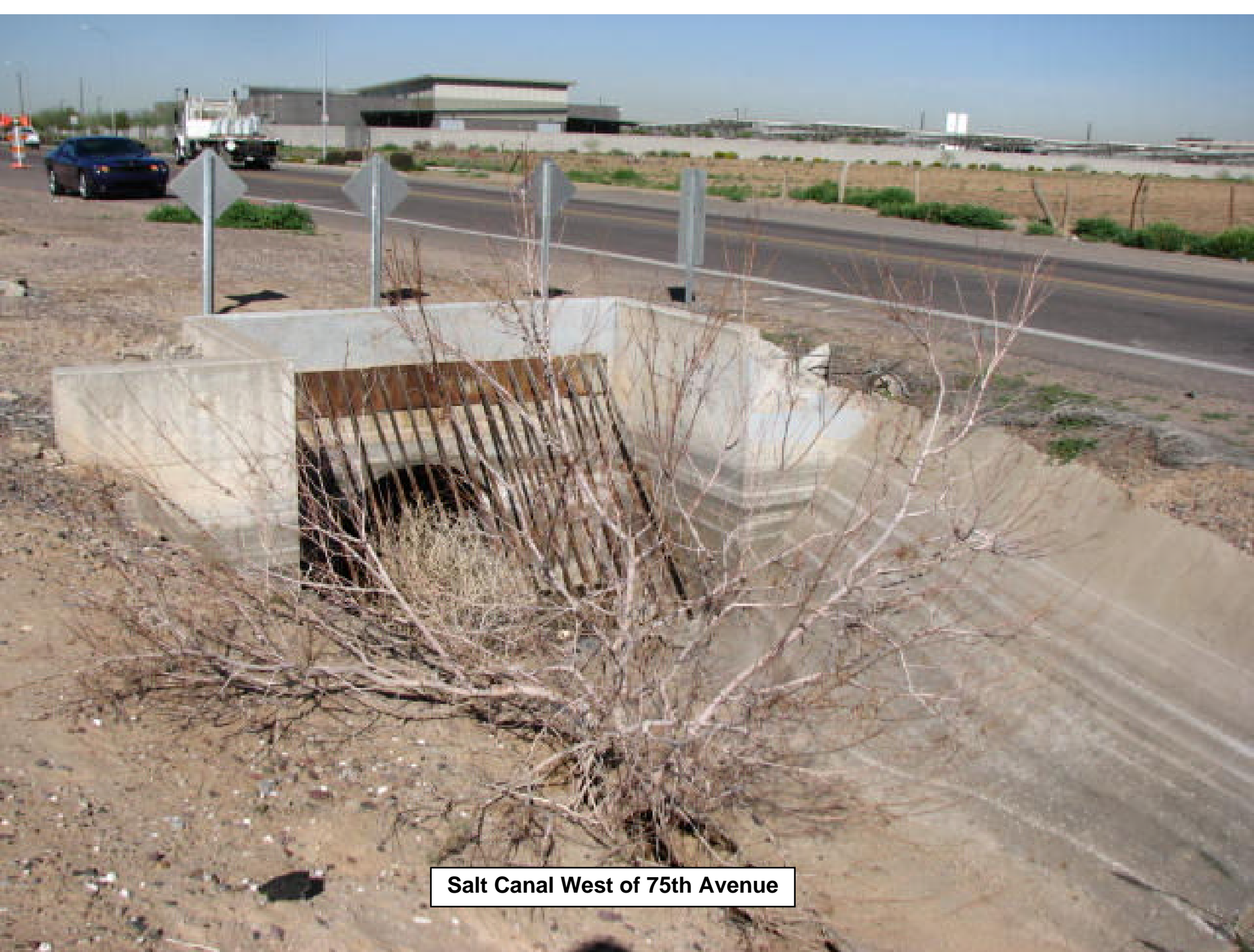
Salt Canal West of 75th Avenue