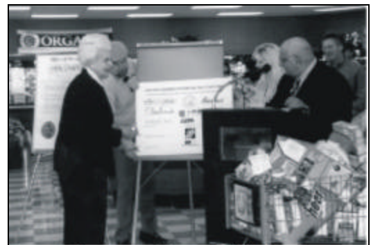
Former governor Rose Mofford and Bashas' grocery store owner, Eddie Basha, pledge to recycle more.

During the month of April 2000, the Arizona Recycling Program worked with local grocery stores and the Bear Essential News for Kids publication to promote the reuse of paper grocery bags. Teachers were encouraged to borrow paper grocery bags from their local grocery store to provide to their students for decorating. The students creatively decorated the bags with an Earth Day message to show that kids care about the environment. Teachers returned the decorated bags to the grocery stores, and on Earth Day (April 22), customers received their groceries in the bags. As in the past, the project alerted students and grocery store patrons of the benefits of reducing trash through reuse and eliminating the need for new bags.