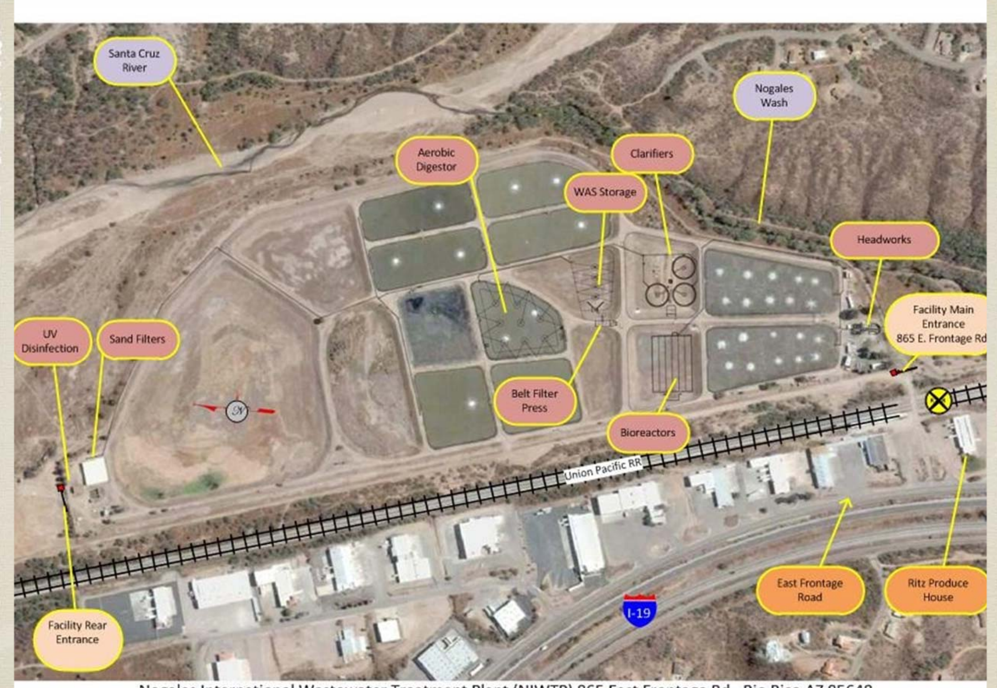
Nogales International Wastewater Treatment Plant (NIWTP) 865 East Frontage Rd., Rio Rico AZ 85648